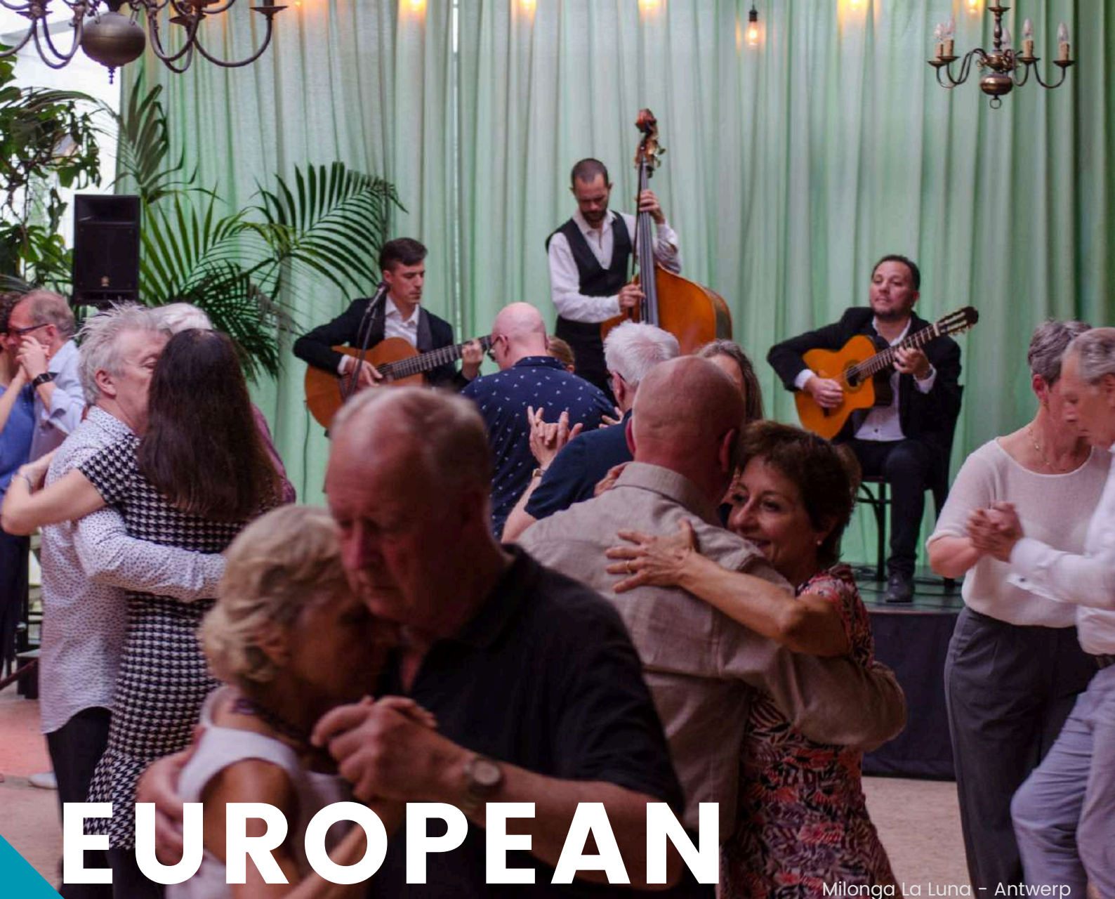
Milonga La Luna – Antwerp